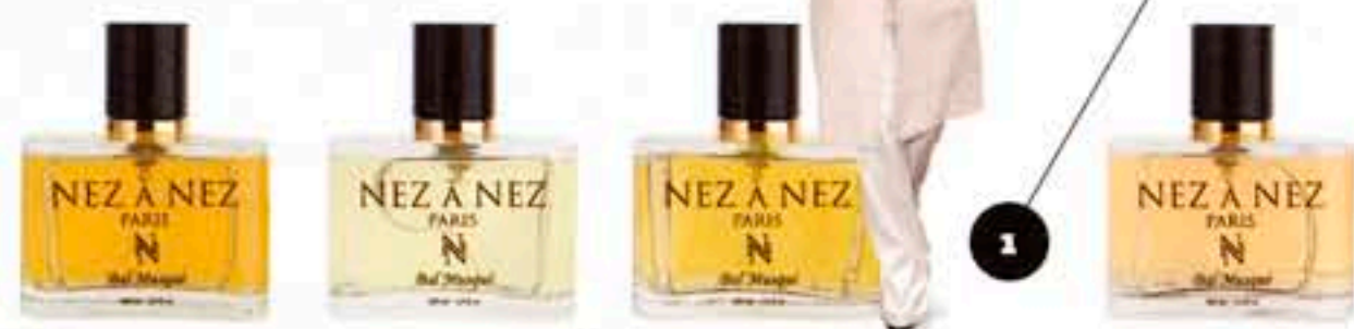
Madonna has a nose for Nez à Nez scents.