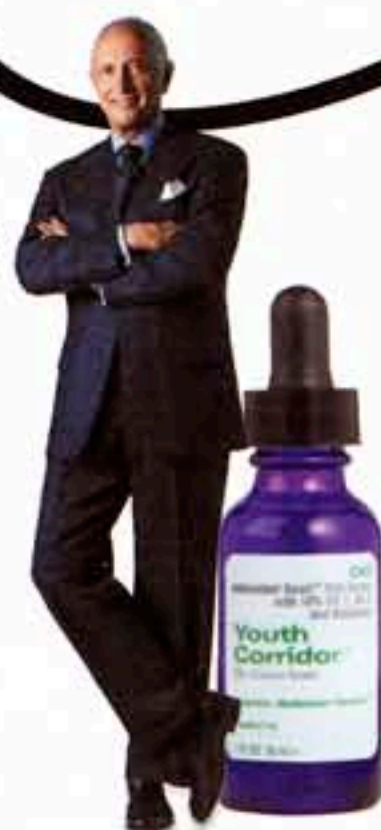
Gerald Imber; Youth Corridor Antioxidant Boost Skin Serum